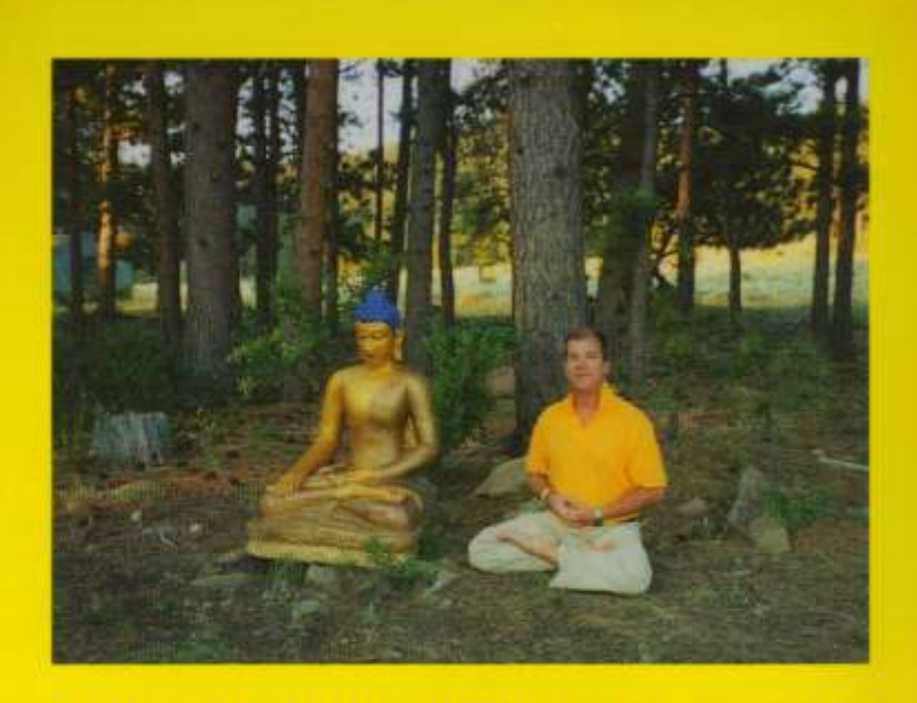
The author at a retreat center next to a statue of Buddha

Meditation and the teachings of The Buddha have become increasingly popular in this modern-scientificinformation age. People from all walks of life have found meditation and the Buddha's teachings helpful for overall health, relaxation, and wisdom. The Buddha's core teaching is in the Eightfold Middle Path and the many other lists of The Buddha. The author guides us through this time-less teaching by explaining the meanings and steps. A total of 90 lists are presented in this book with 29 of the most important ones explained in detail, including the four evolutionary stages of religion in the Foreword.